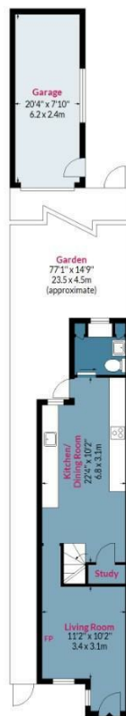
Ground Floor Floor Area 415 Sq Ft - 38.55 Sq M